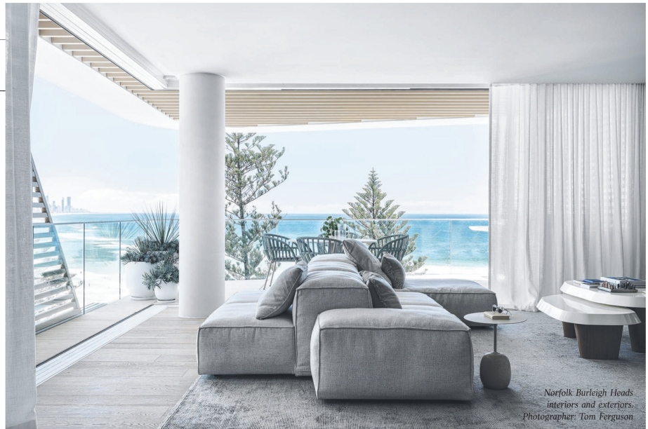
Norfolk Burleigh Heads interiors and exteriors.

"The tapered kitchen island, meticulously shaped from solid travertine, is a subtle nod to the